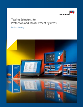
Product catalog (secondary equipment)

The following publications provide detailed information on the products described in this brochure and their applications: