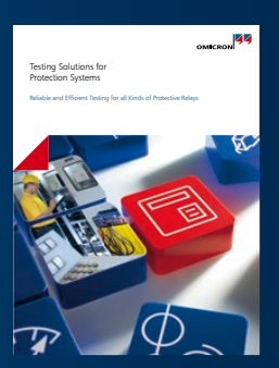
Testing Solutions for Protection Systems

For more information, additional literature, and detailed contact information of our worldwide offices please visit our website.